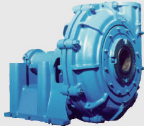
A-C 14X12-36 SRL-XT Pump

Contact your local Goulds Pumps Distributor or visit our websites at www.acpump.com — www.gouldspumps.com