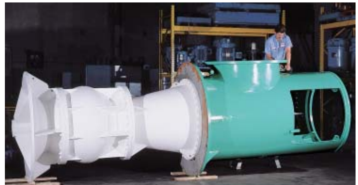
All final checks are made prior to shipment to insure product meets customer requirements. Also, all units are tagged for tracking maintenance history and failure analysis.