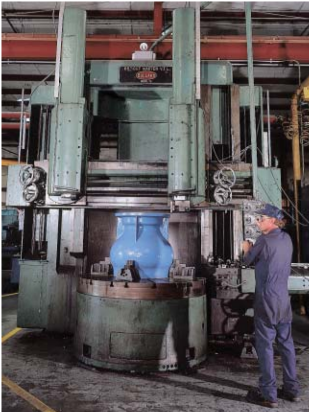
PRO Services™ Centers have full machine capability to address needed repairs.