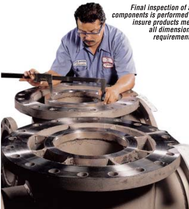
Final inspection of all components is performed to insure products meet all dimensional requirements.