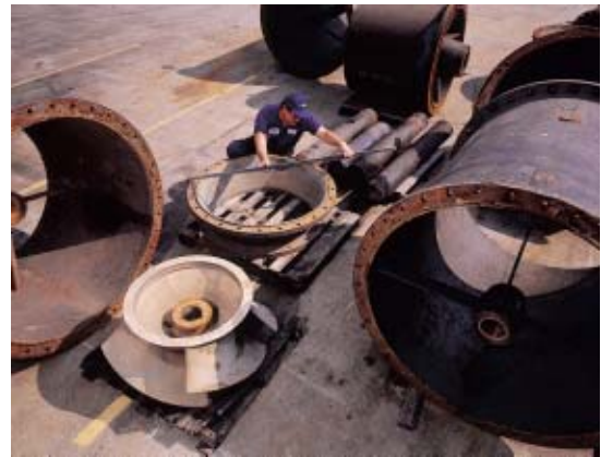
Disassembled pumps are inspected for unusual wear.