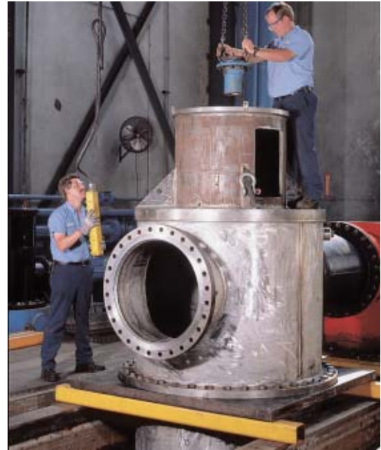
New discharge heads can be provided to address vibration problems. Complete head analysis can be accomplished if required and tested at our Los Angeles facility.