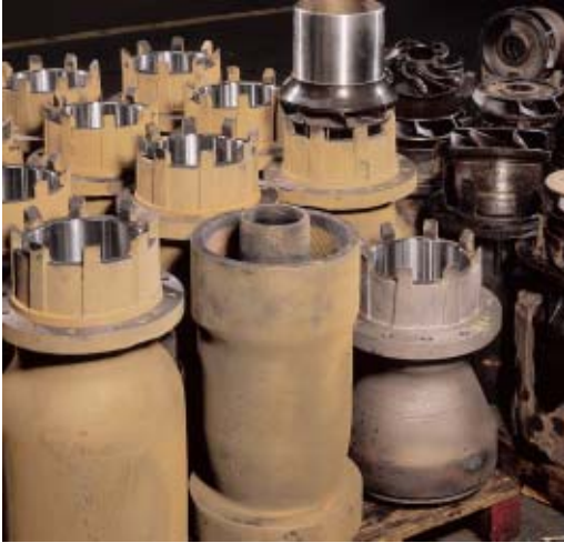
Special vertical applications welcomed. Above are some geothermal units that are being rebowled. ITT Industries can handle some of the toughest applications

PRO Services™ can easily restore your vertical turbine pump's original performance (and in many instances, improve it) by rebowling. Complete new liquid ends match all makes of vertical turbine pumps from 6" to 120" ... regardless of manufacture.